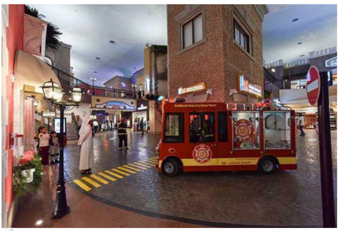
Tweet 1 0 Google +0

KidzMondo Doha, Qatar's one-of-a-kind miniature edutainment city, in collaboration with Renad Academy (RA), a Qatar Foundation (QF) school, recently celebrated World Autism Awareness Month by hosting children from 11 different schools around Qatar to the fun-filled City.