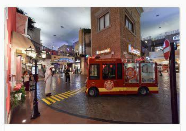
KidzMondo Doha Celebrates World Autism Awareness Month

POSTS LIKES FOLLOWING ASK MEANYTHING ARCHIVE