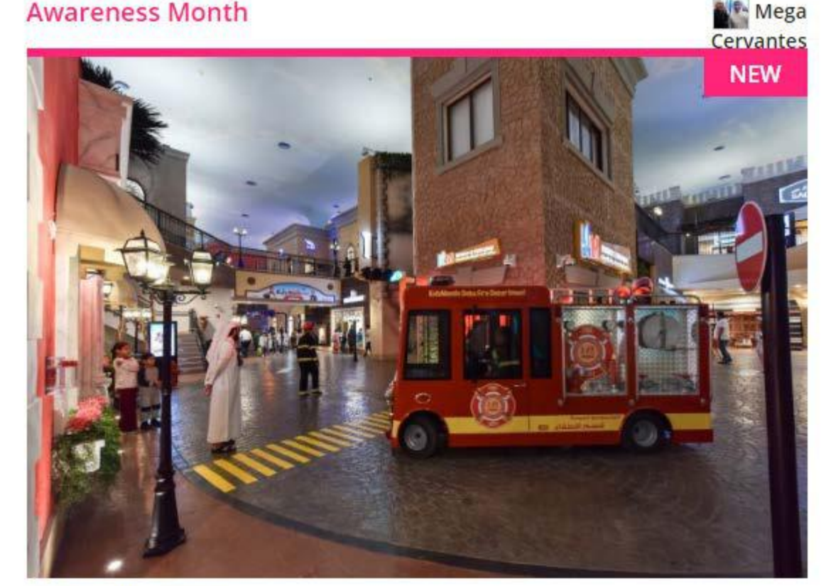
Last Updated on 27 April 2017