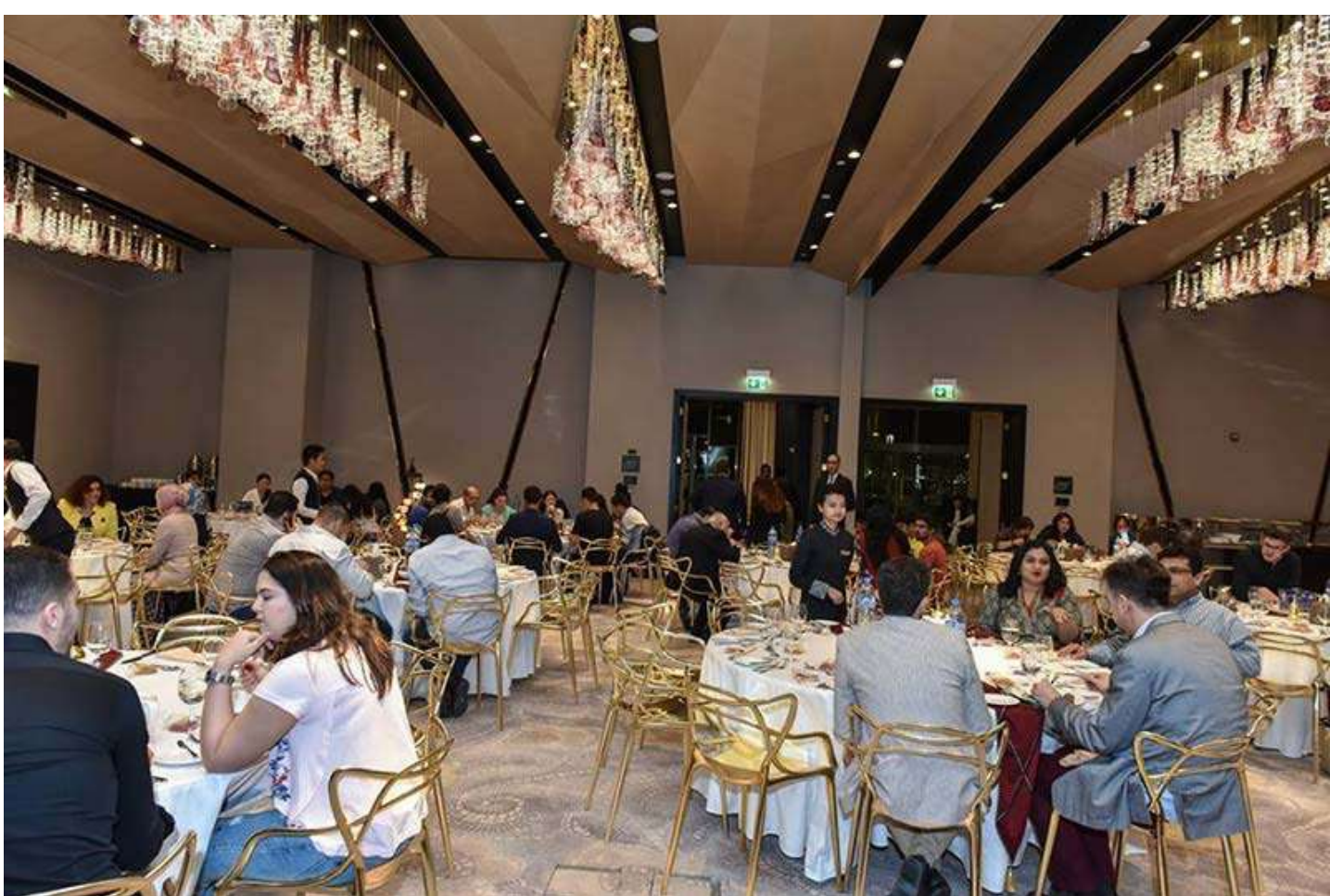
During the month of Ramadan, KidzMondo Doha is initiating many activities involving its young visitors as kidizens are having the opportunity to learn about doing 'Sadaqa' – donation – as part of KidzMondo Doha's initiative in cooperation with Qatar Charity, Tayf and Jouf water which will encourage children to be more involved in corporate social responsibility initiatives. To further encourage the kids to 'Live the Spirit', a story-teller – 'Hakawati' – is bringing the children to gather round and listen to special anecdotes and mementos of traditional Ramadan practices, educating them with the significance of the virtues surrounding Ramadan. Another special onground engagement is held in the presence of the Ramadan 'Mesaharati' – who will take a walk around the indoor theme park, beating his drum in honor of the traditional drummer that walks the streets before dawn to wake those that are sleeping, in order to have a small meal before fasting resumes.