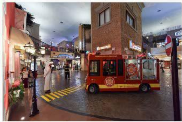
KidzMondo Doha Celebrates World Autism Awareness Month

POSTS LIKES FOLLOWING ASK ME ANYTHING ARCHIVE