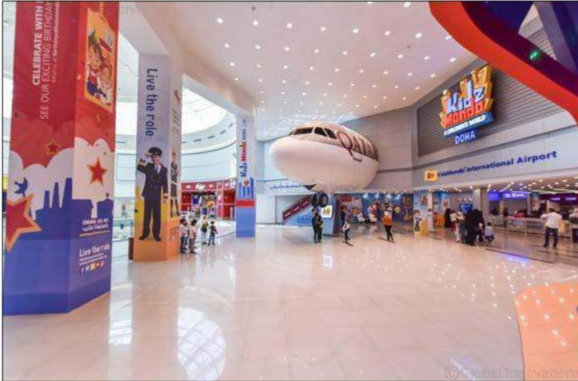
The Kidizen Experience at KidzMondo

Doha, Qatar – April 17, 2017 – Every parent wants their kids to realize their potential and grow up to become successful, accomplished adults who make a difference in their own lives as well as the lives of those around them. In today's world, that's no easy feat, especially considering the constant barrage of 21st century distractions and a limited realm of exploration that stack the odds against children and youngsters.